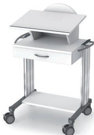
swingo® 60 in wood-plastic standing desk cart