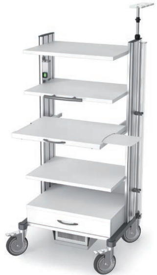
swingo®-clinic 60 in metal endoscopy cart 60.2