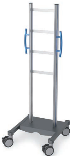
swingo®-clinic in metal infusion pumps cart