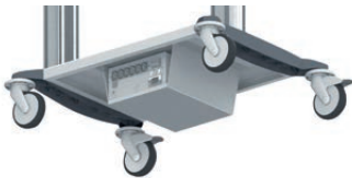
Undermount isolating transformer