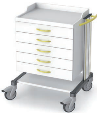
swingo®-clinic 60 in metal anaesthesia cart