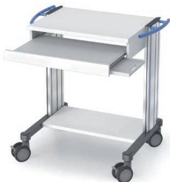
swingo® 60 in wood-plastic computer cart