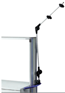
Cable and hose holder