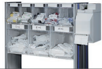
Injection set PicBox® + KOMBİ-set