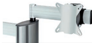
„alegro“ monitor holder on swivel arm