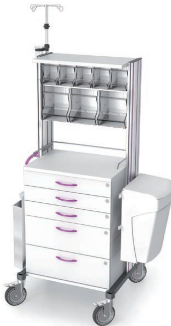
swingo® 60 in wood-plastic treatment cart