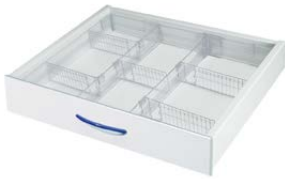
Drawer + variable inset