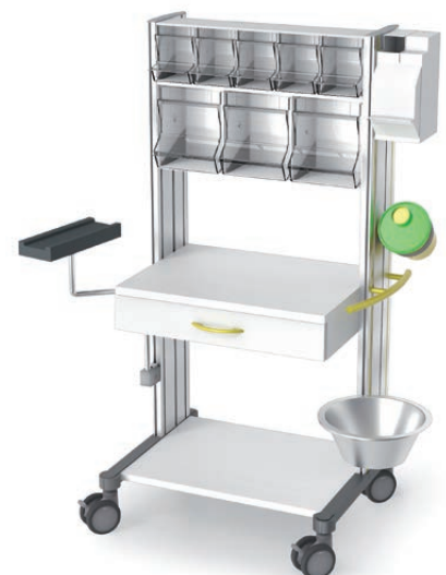
swingo® 60 in wood-plastic injection cart PicBox®