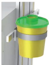
„Medi-Müll set“ 20 boxes 1,5 ltrs.