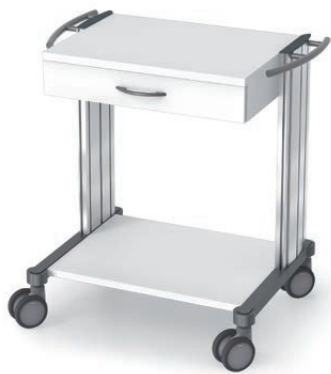
swingo® 60 in wood-plastic basic cart