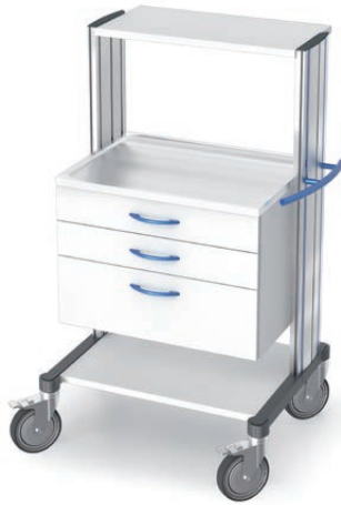
swingo®-clinic 60 in metal emergency cart 2