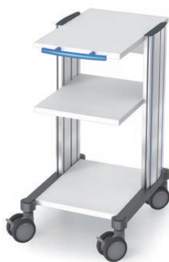
swingo® 45 in wood-plastic sonography cart