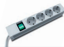
Multiple standard socket outlet