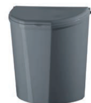
Waste collector „tomo“