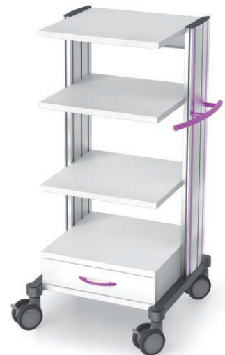
swingo®-clinic 45 in metal equipment cart