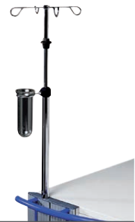
Infusion bottle holder