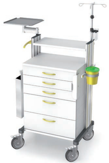
swingo®-clinic 60 in metal emergency cart