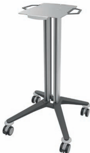
bravo - basic cart 2