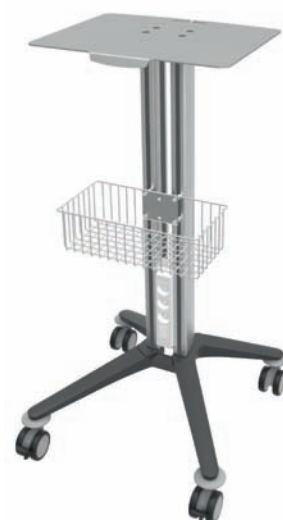
bravo - equipment cart 2