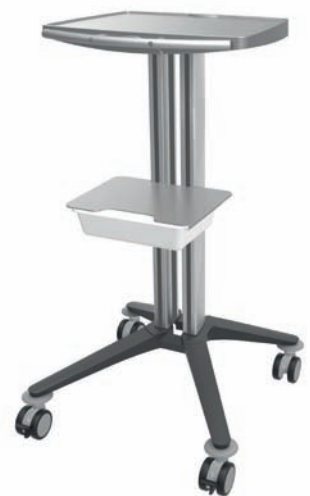
bravo - dental cart 1 Ref. no. 2709.1