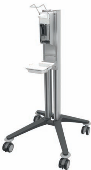
bravo - hygiene cart 1 Ref. no. 2747.1