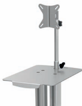
Plate with TFT mount