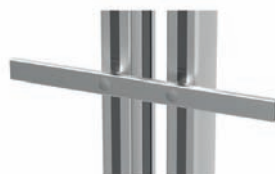
Standard profile rail