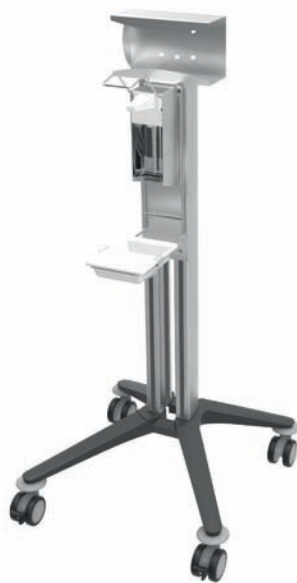
bravo - hygiene cart 2 Ref. no. 2708.1