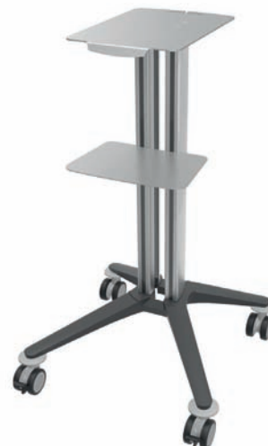
bravo - basic cart 3