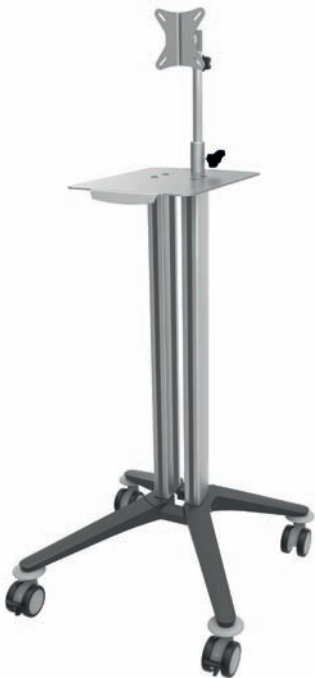
bravo - computer cart 1 Ref. no. 2715.1