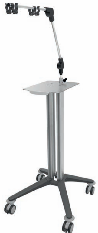
bravo - ergometry cart 1 Ref. no. 2718.1