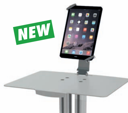
Plate with tablet mount