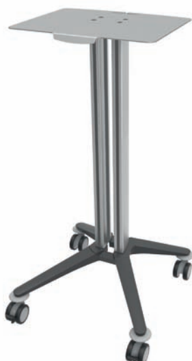
bravo - basic cart 6