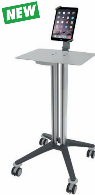
bravo - tablet cart 3 Ref. no. 2755.1