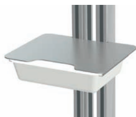
Plate with storage bowl