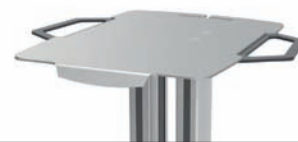
Plate with push handles