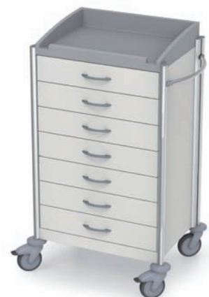
Treatment trolley 2