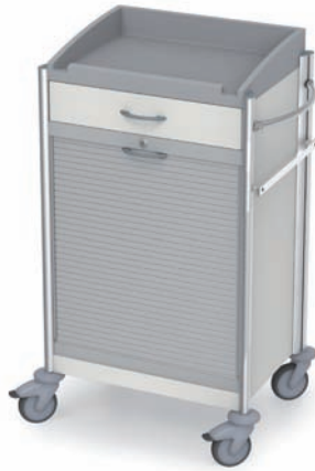
ISO module trolley 4