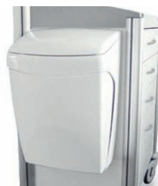
Waste collector „tango“ 8 ltrs. with knee operated opening system