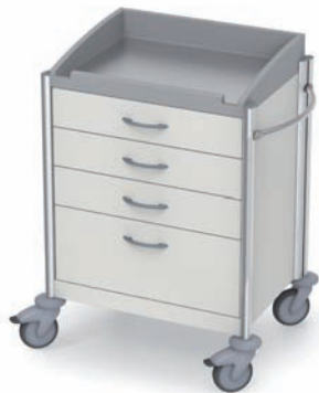
Anaesthetic trolley 2