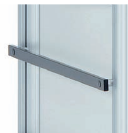
Standard profile rail, stainless steel for lateral fastening to keo®