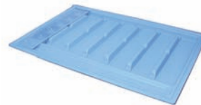
ISO module medication dispenser