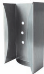
Stainless-steel holder for dispenser boxes, for 1 box