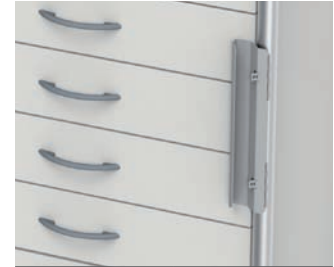
Anti-tamper seal for 3 grids