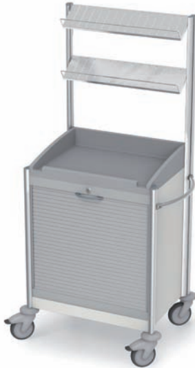
ISO treatment trolley 3