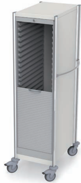
ISO module trolley 7