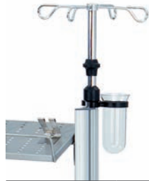
Infusion bottle holder