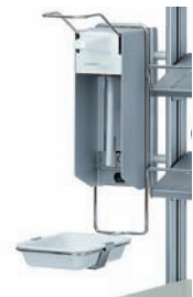
Soap and disinfectant dispenser, capacity 1litre