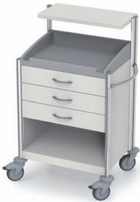
ISO emergency trolley 2