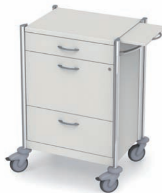
Treatment trolley 5