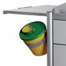
Disposal „Medi-Müll“ box set with 20 boxes (1,5 ltrs.) and mount