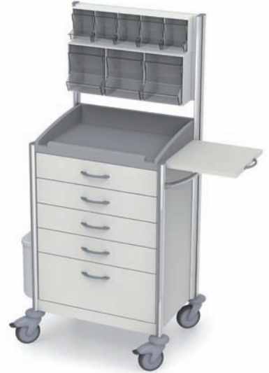
ISO treatment trolley 8