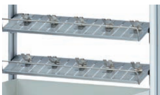
Organisation system with 2 inclined storage levels in stainless steel