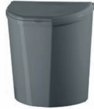
Waste collector „tomo“